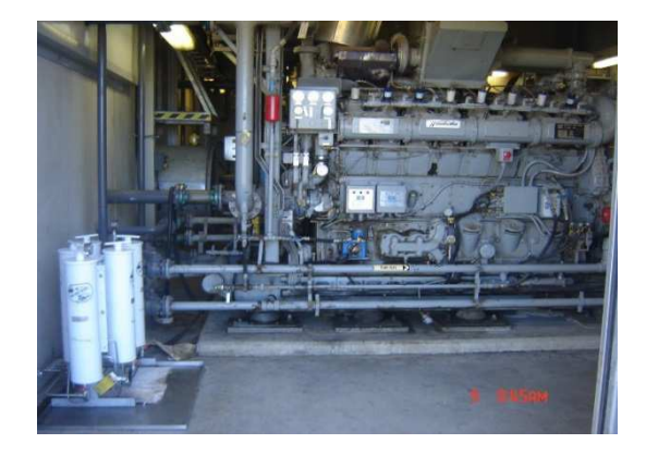
Fig. 1: 1995 Modell F18GL Waukesha K-005

Project Task: Application with REWITEC® PowerShot® to reduce wear and prolong lifetime